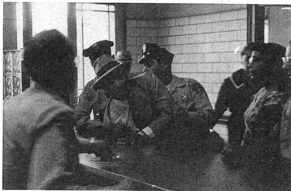
(Top) Martin Luther King, Sr. and Jr., 1950s; (bottom) Martin Luther King, Jr., being arrested, Montgomery, Alabama, 1958.